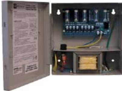
Enclosure Dimensions ( 8.5"H x 7.5"W x 3.5"D)