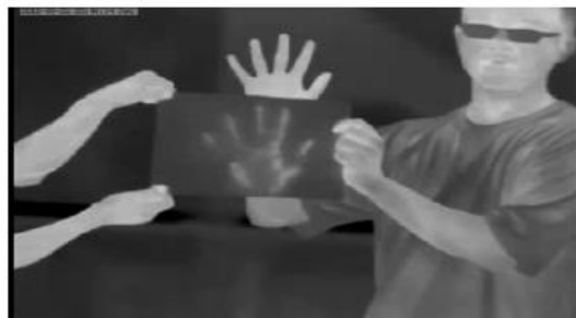
Residual heat detection