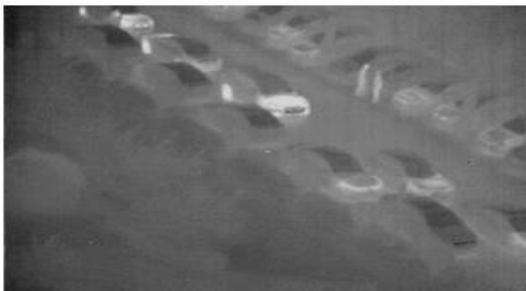
Night remote parking monitoring