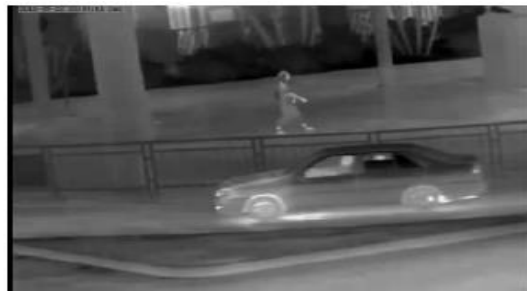
Night road monitoring