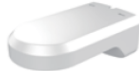
wall mount (optional) IV-4MP-1694WM