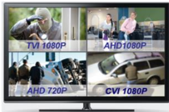
Auto Detect Different Modes