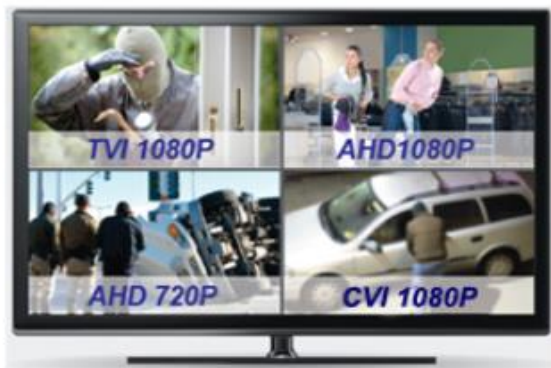
Auto Detect Different Modes