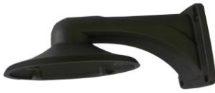
Optional Accessory-Wall Mount IV-BR6100