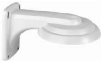
Optional Accessory: Wall Mount IV-WM502