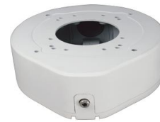
Junction Box (optional) IV-JBK02W