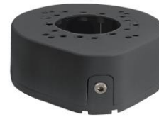
Junction Box (optional) IV-JBK02G