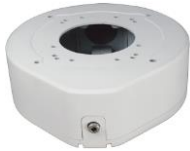
Junction Box IV-JBK01W (optional)

HD CVI/HD TVI/AHD/ANALOG Output Selectable from Water Proof Toggle Switch